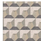
Grey and Cream