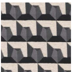
Black and Cream