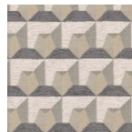
Grey and Cream