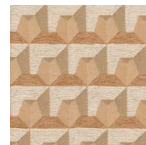
Tan and Cream