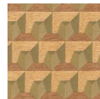
Yellow and Greens