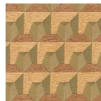
Yellow and Greens