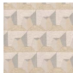
Sand and Cream