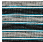
Aqua and Navy