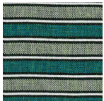
Aqua and Green