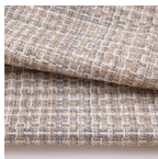
Tan and Grey