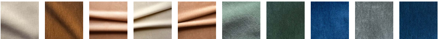
Cream Butterscotch Shell Oyster Light Clay Aloe Pine Navy River Ocean